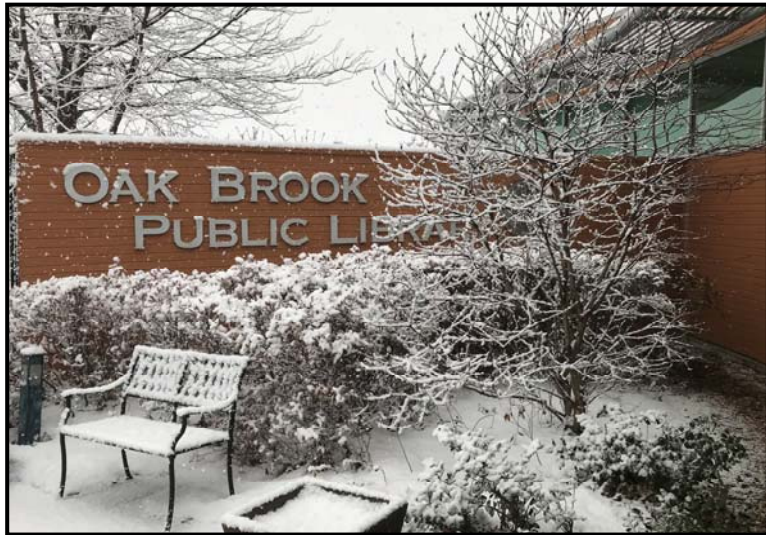
The Library turned into a winter wonderland!